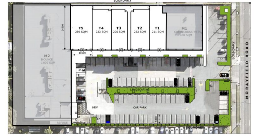
RE-GROW PRELIMINARY SITE PLAN

For any more information, please contact the exclusive Blue Commercial agents below.